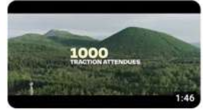
Film promotionnel pour les 90 ans de la Traction avant