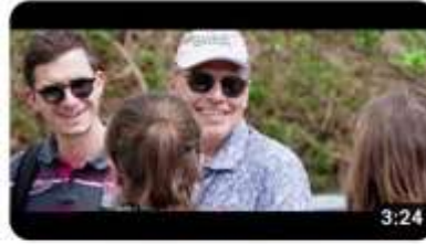
Let's go pour les 90 ans de la Traction avant

You'll find these videos on our Youtube Channel , along with testimonial videos from our foreign correspondants.